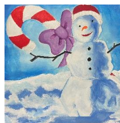
Ryellie, Scarborough Village

All artwork must be created by youth currently enrolled in the Pathways Program , and participation is limited to one submission per student.